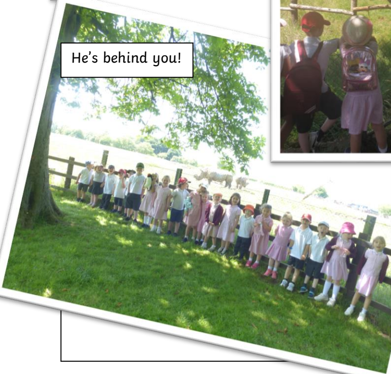
He's behind you!