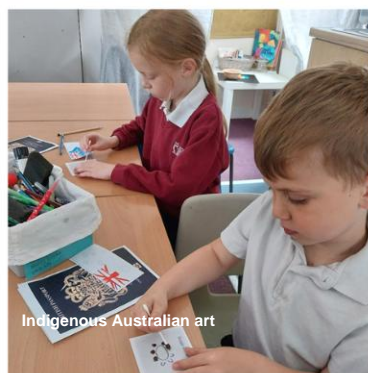
Indigenous Australian art