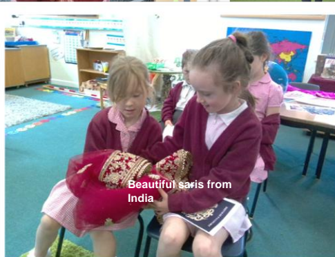
Beautiful saris from India

One of our parent experts said: This was such a lovely day and it was SO nice to see all the children get involved in absolutely everything from trying food, to dancing and learning a new language. They had such great questions and were so respectful too.