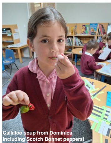
Callaloo soup from Dominica including Scotch Bonnet peppers!