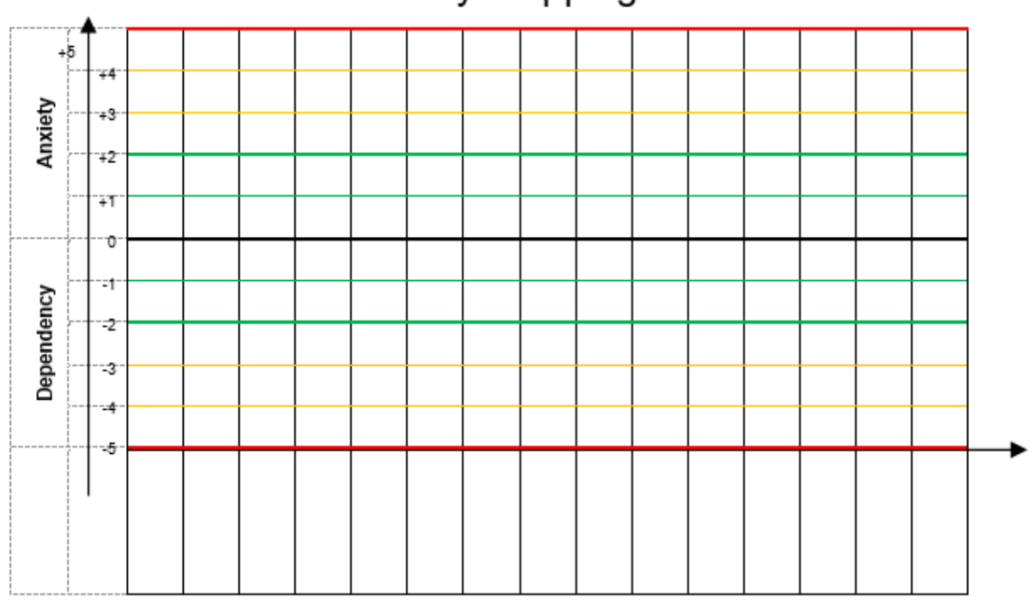
Time of day, days of the week, supporting staff, location, activity, learning style, peers. etc