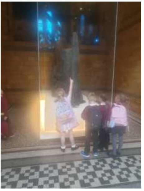
Special Educational Needs (SEND)

All children are valued, respected and welcomed to the school whatever their additional educational need. We will support their learning and ensure they are fully included in all school activities, making full use of externally provided facilities where appropriate. It is the Governors' duty to ensure that the necessary provision is made for any pupil with special educational needs. The School has a SENCo who liaises with parents, extended services and other agencies.