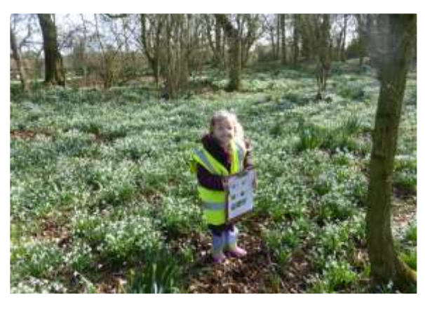
Reed First School can be found nestled in the centre of the village of Reed,

surrounded by farmland and a few residential dwellings.