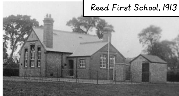
Reed First School, 1913